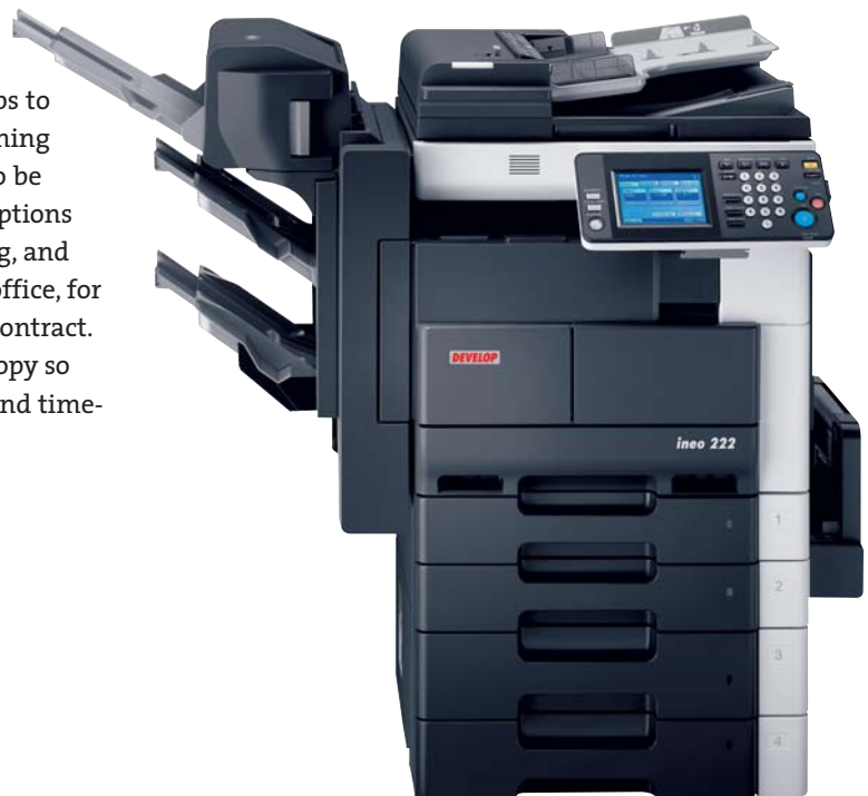
ineo 222 with embedded finisher (FS-530), saddle stitch unit (SD-507), paper cassette (PC-206) and document feeder (DF-620)

The ineo 222 not only prints and copies to professional standards, it also offers a wide range of useful scanning functions such as scan to e-mail, which allows scanned documents to be sent direct to a recipient's e-mail address. Users can also scan to and print in and out of an optional password-protected box, which gives every user individual storage space on the system's hard disk. Documents, for example, can be stored in that box ready for reprinting – a convenient feature that means there is no need to reopen the document on a PC.