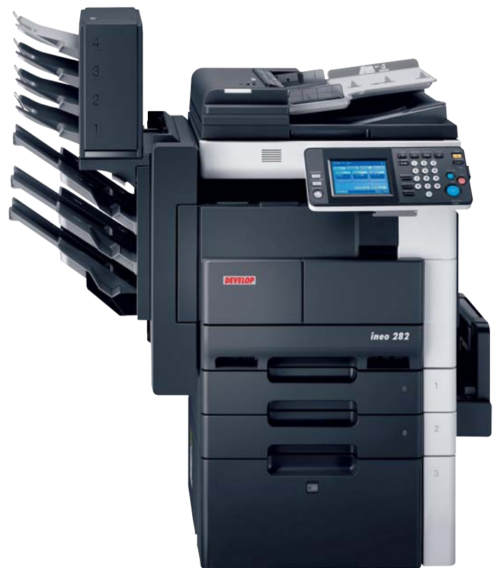
ineo 282 with embedded finisher (FS-530), mail bin unit (MT-502), additional bin (OT-602), large paper cassette (PC-407) and document feeder (DF-620)

The ineo 282 not only prints and copies to professional standards, it also offers a wide range of useful scanning functions such as scan to e-mail, which allows scanned documents to be sent direct to a recipient's e-mail address. Users can also scan to and print in and out of an optional password-protected box, which gives every user individual storage space on the system's hard disk. Documents, for example, can be stored in that box ready for reprinting – a convenient feature that means there is no need to reopen the document on a PC.